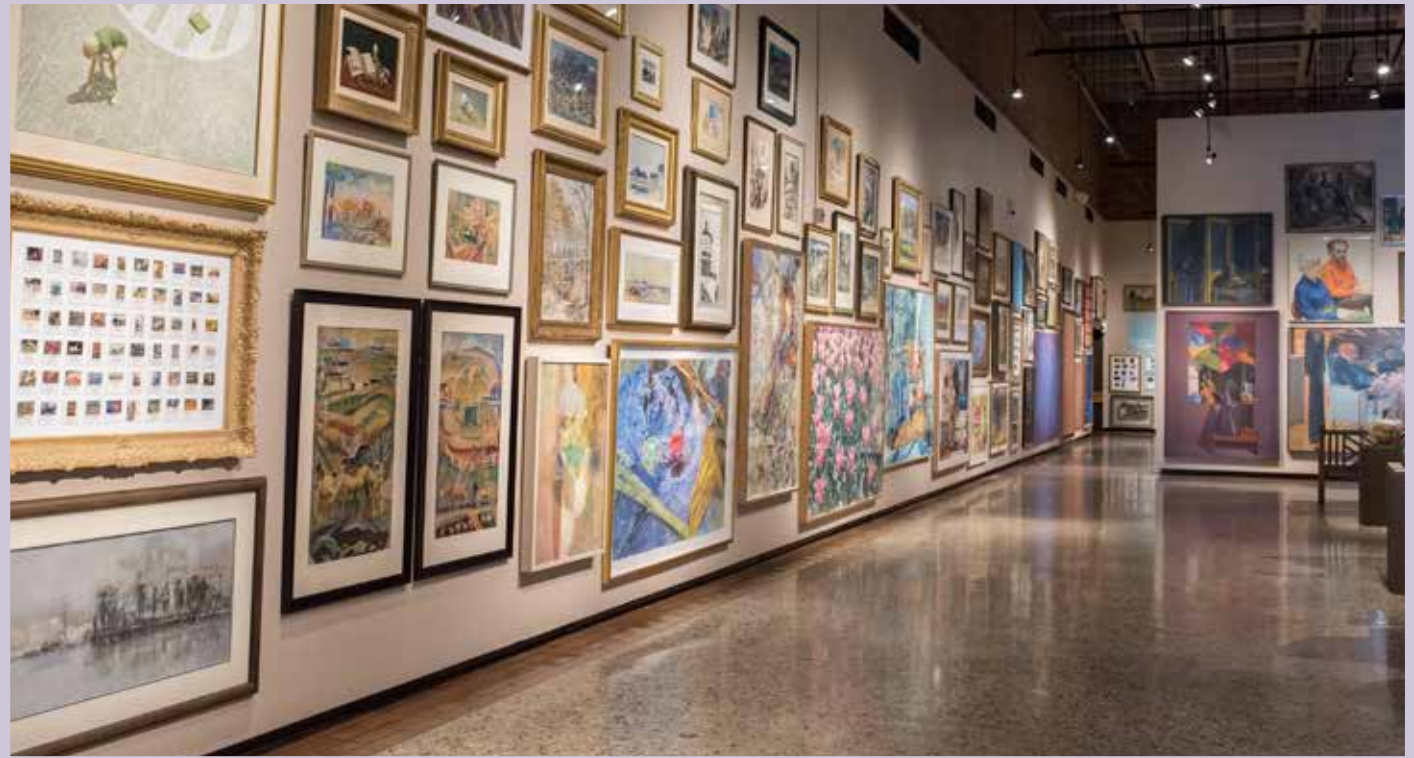
Over 200 pieces from the CMA Permanent Collection are on view.

A Unique Display of Works from the CMA Collection