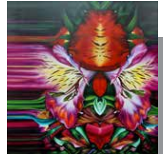
Gypsy , Oil on Canvas