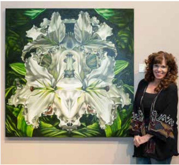
Moonlit , Oil on Canvas