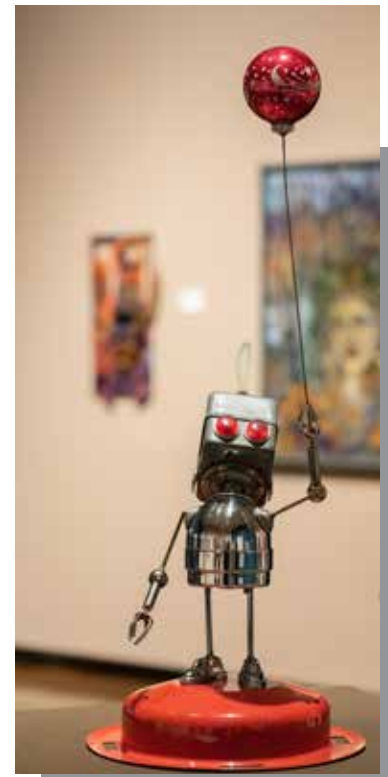
Artist: Damon Drummond Robert's Balloon , Found Object Metal

THE CANTON MUSEUM OF ART'S ANNUAL CANTON ARTS DISTRICT ALL-STARS EVENT WAS HELD ON FRIDAY, NOVEMBER 2ND, AS A ONE-NIGHT ONLY SHOW. ARTISTS WHO CELEBRATE THE SPIRIT OF THE CANTON ARTS DISTRICT, SUBMITTED ARTWORK TO CMA WHERE IT WAS ON VIEW FOR ALL TO ENJOY!